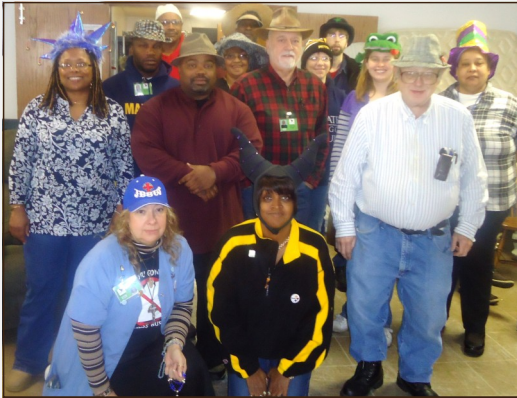
To help combat the cold and dreary weather, POPC celebrates Hat Day on January 21.

To read these stories in full and see more photos, please visit the news page of our website: www.princeofpeacecenter.org/news