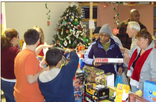
Hickory Middle School Student Council members lend a hand to the Center on Toy Day, assisting families in choosing the perfect Christmas toys for their children.